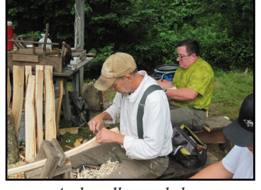
Ax handle workshop