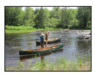
Canoe poling workshop